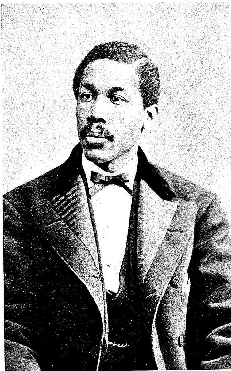
Octavius V. Catto (1839-1871), Philadelphia educator, Freedom fighter and Civil Rights Activist