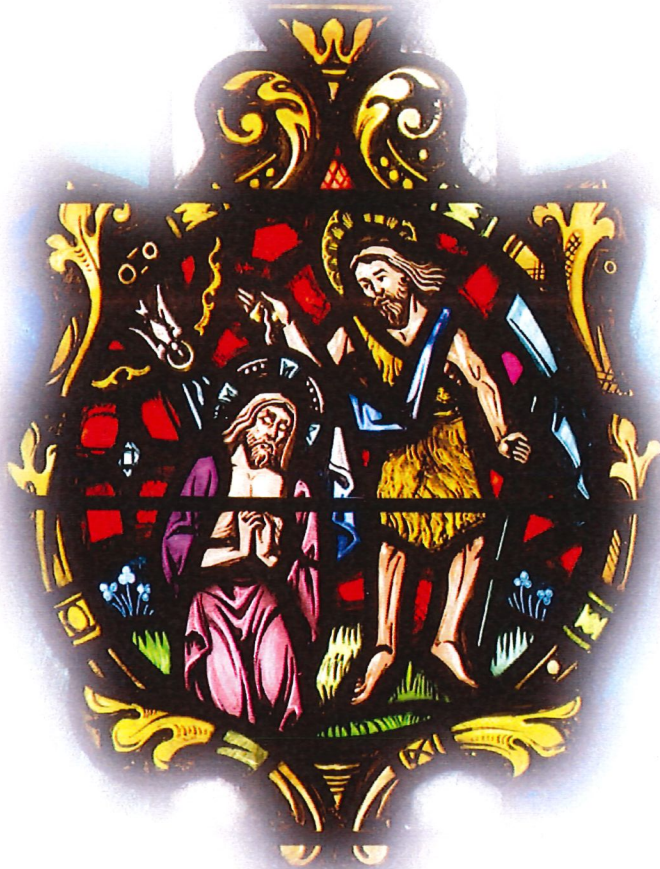
John baptizing Jesus (South Transept)